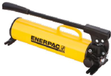
P-Series, Hand Pumps

Featuring Hand, Battery, Electric, Air and Gasoline powered models, Enerpac offers the most comprehensive pump line available.