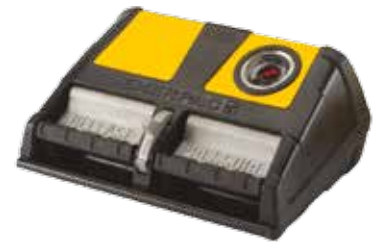
XA-Series, Air Driven Pumps