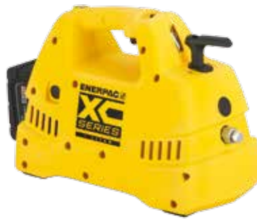
XC-Series, Cordless Pumps