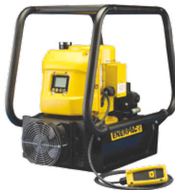
ZE-Series, Electric Pumps