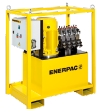
SFP-Series, Split-Flow Pumps