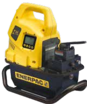
ZU4-Series, Portable Electric Pumps